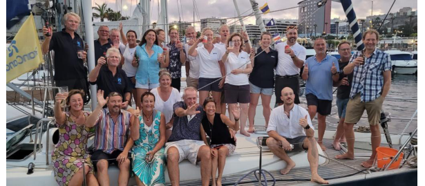
Image: BYO Party las Palmas

Las Palmas, Grand Canaria: date TBC, will be held one evening during the week before the start in early November.