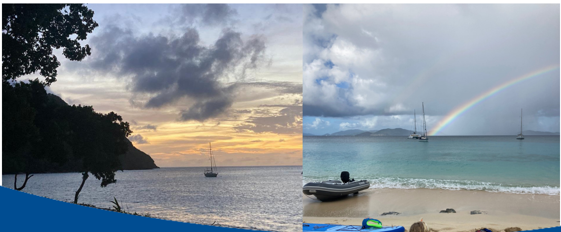
Image: Peaceful anchorage in Caribbean